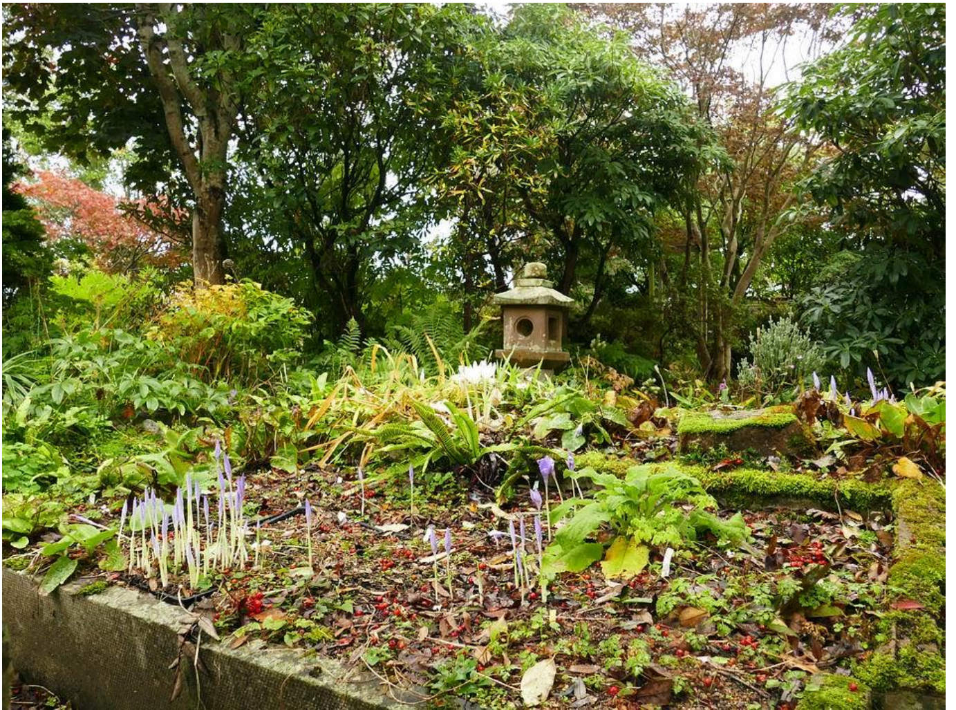
Heading up the garden I pass the Erythronium plunge, rock garden bed and Japanese lantern.