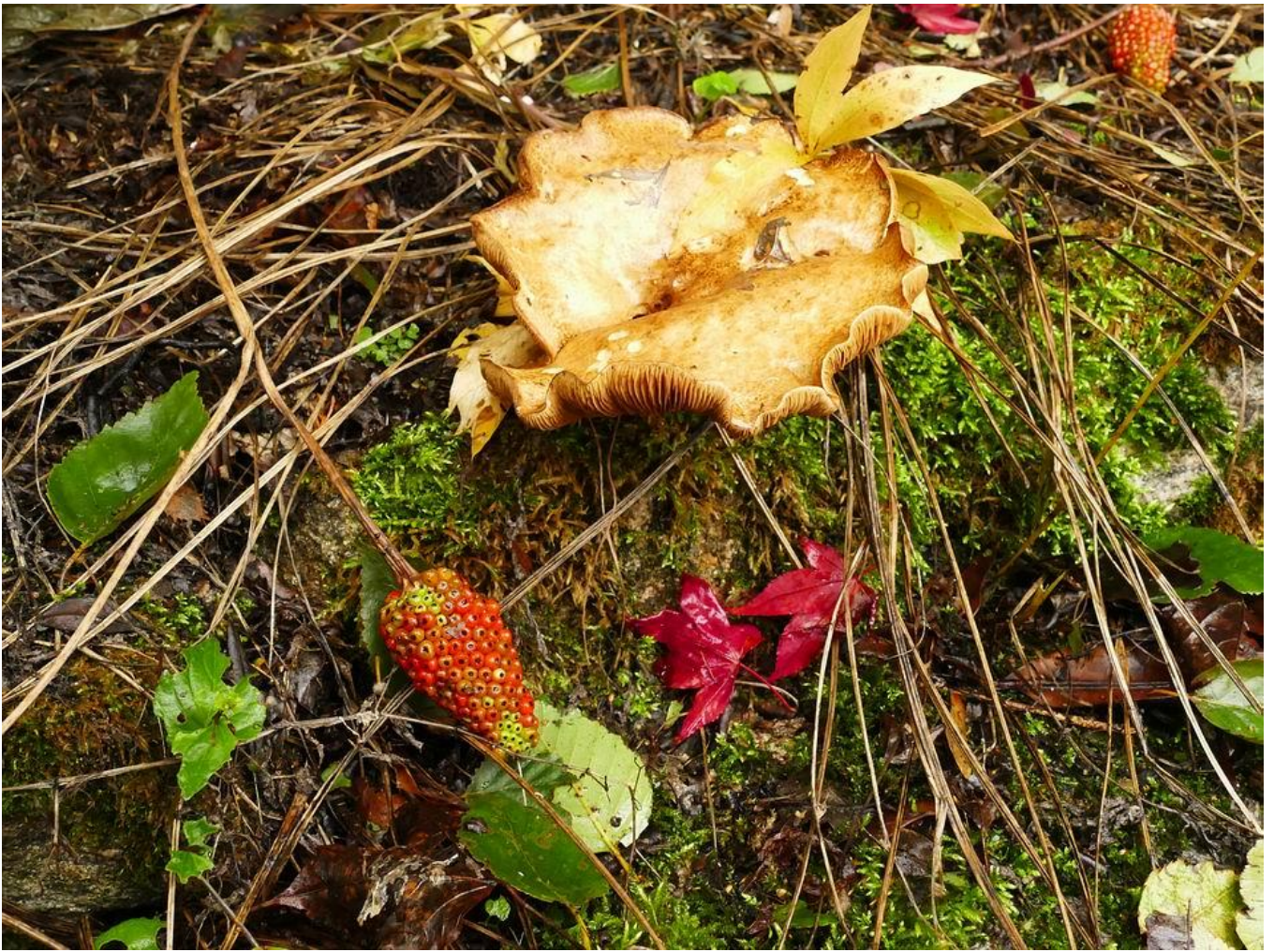
A typical autumn scene in the garden is represented by some old stems, red leaves, Arisaema seed head and fungus.