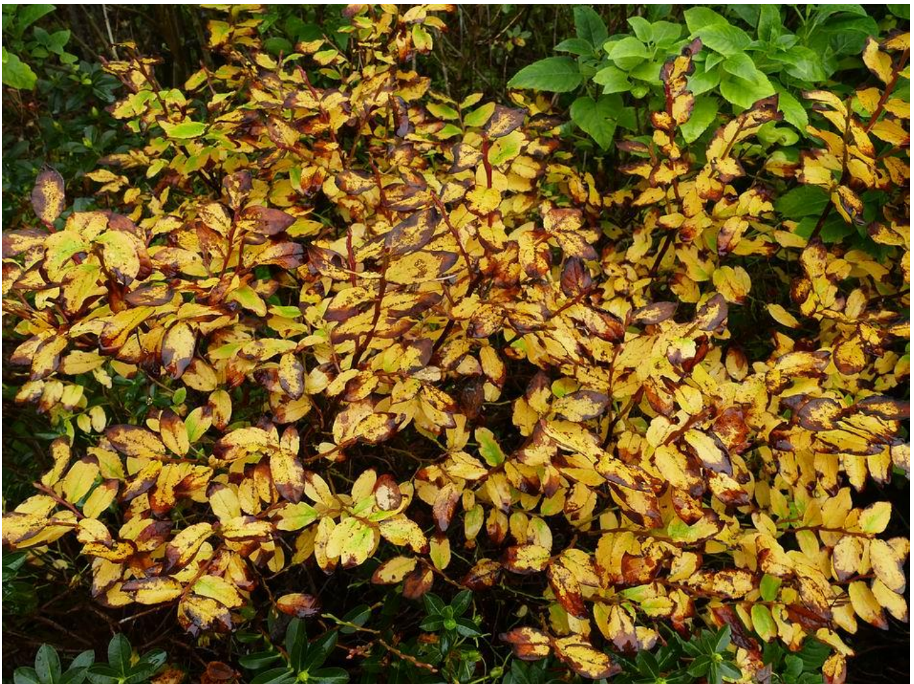
The leaves on this Vaccinium sp. from Japan turn yellow briefly before going brown and dropping off.