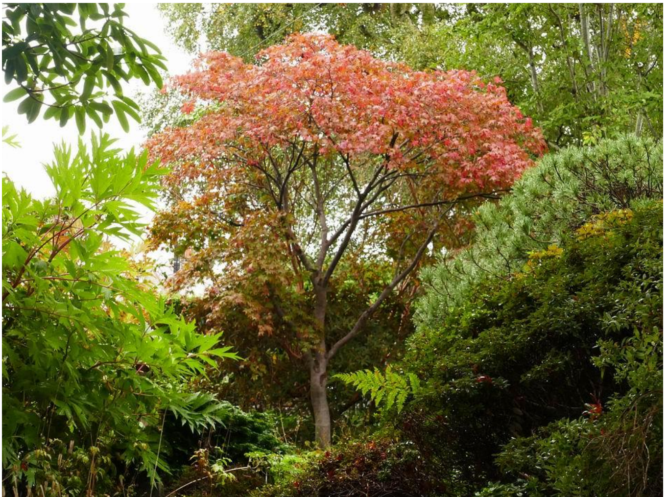
The eye focuses in on this Acer palmatum 'Osakazuki' with the start of its autumn colours from close up as well as various viewpoints as I walk around the garden as shown in the following two pictures.