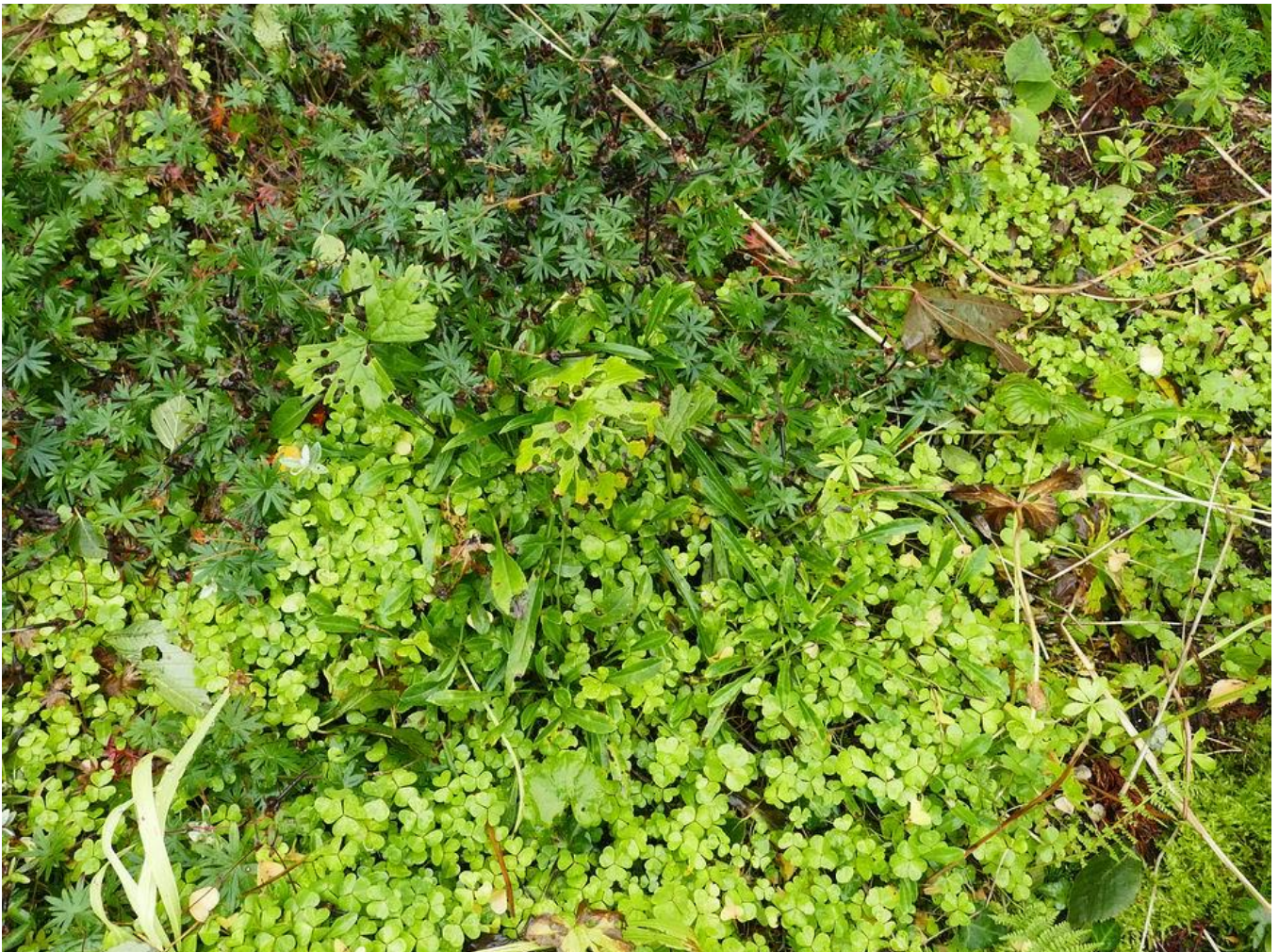
While autumn paints bright colours above, the ground is still covered in a lovely mixed green carpet.