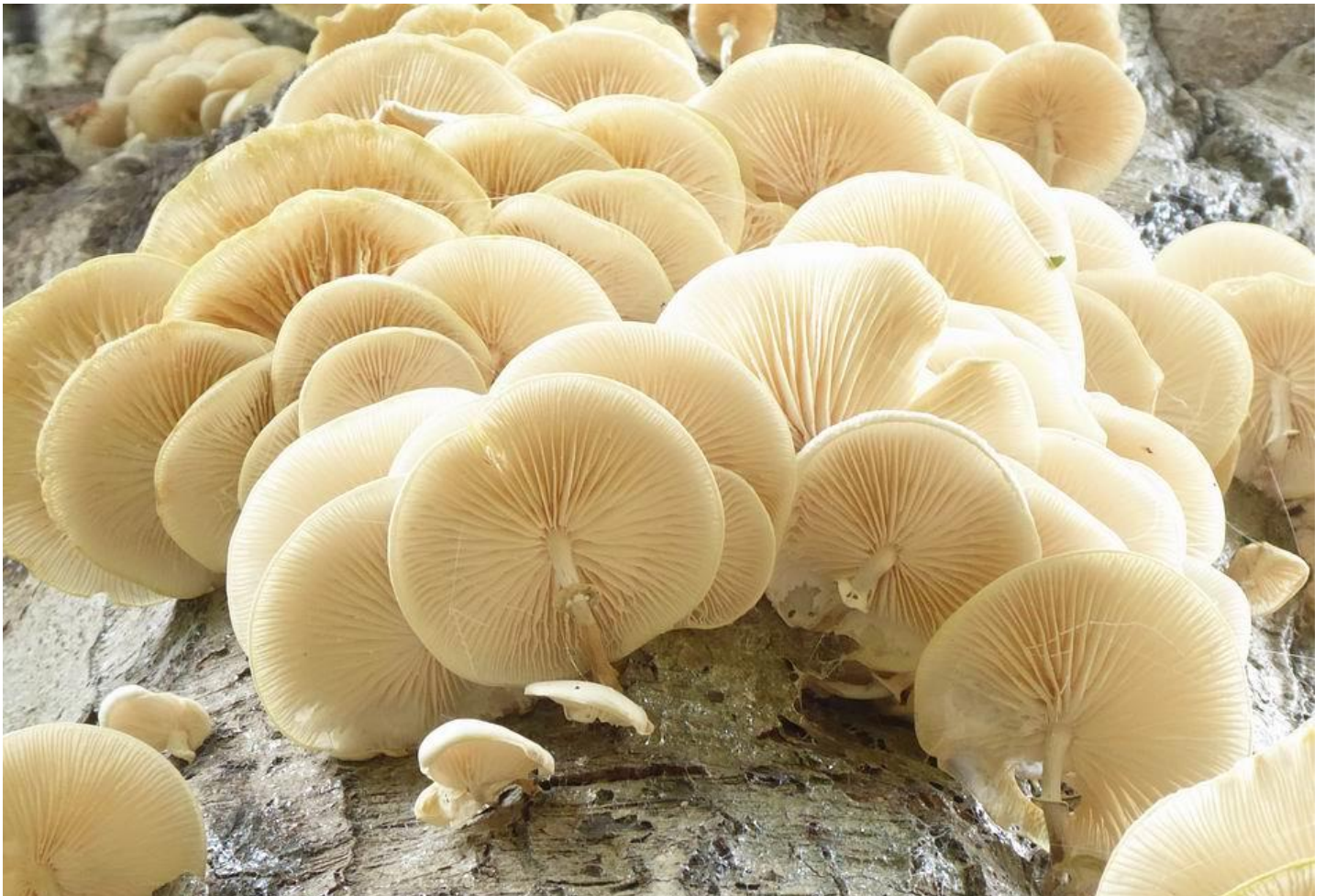
The pristine semi-transparent white mushrooms look as if they were made of porcelain by a very skilled ceramicist.