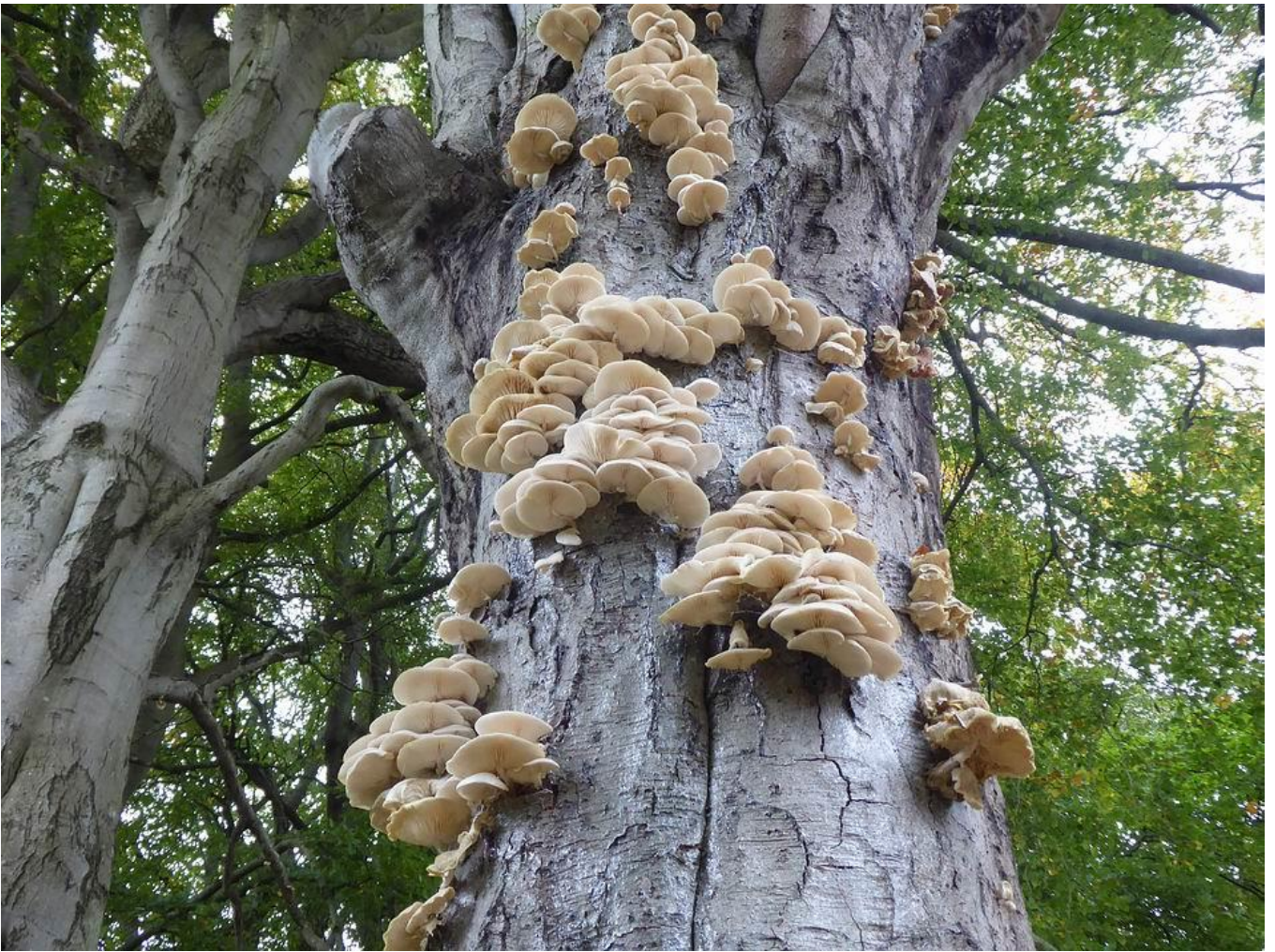
Another beautiful outcrop of fungi I spotted is this white bracket type with gills growing on a section of a beech tree below where a rotten branch had broken off some years previously.