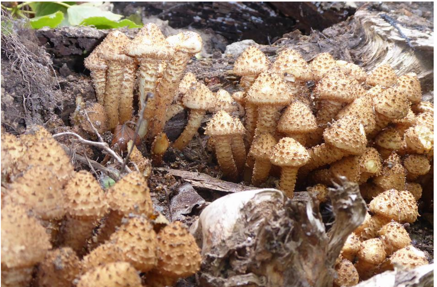
I collect only images of these fascinating structures by taking a series of pictures.