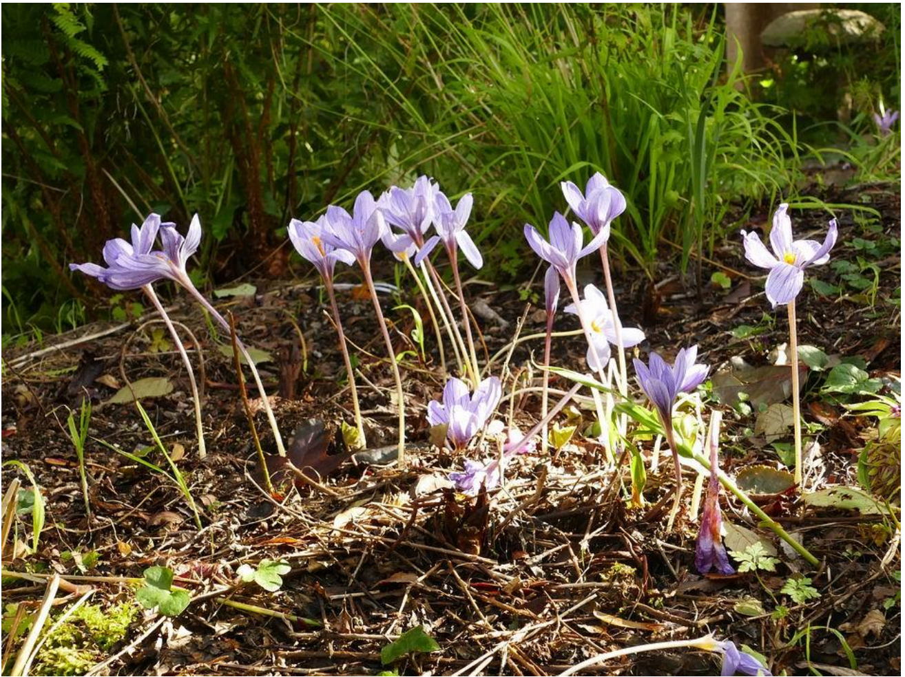
The populations of autumn flowering crocus around the garden are increasing every year as they are allowed to seed, here it is the flowers of Crocus speciosus that are catching the light.