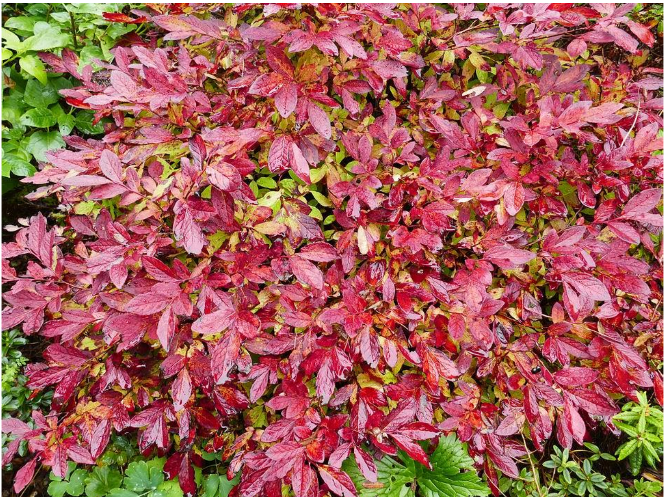
Nearby and grown from the same seed collection, AGS Expedition to Japan (1988), Vaccinium smallii turns a lovely deep red before it drops its leaves.