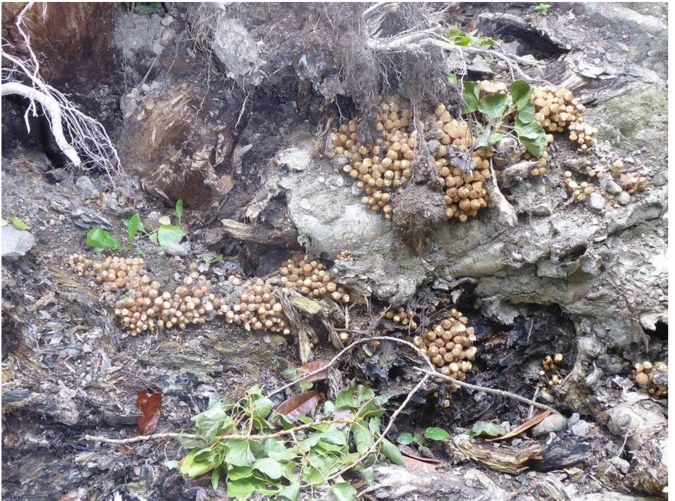
There is a wonderful crop of fungi, which I think are Shaggy Scalycaps ( Pholiota squarrosa ?), growing on the bottom of the root ball.