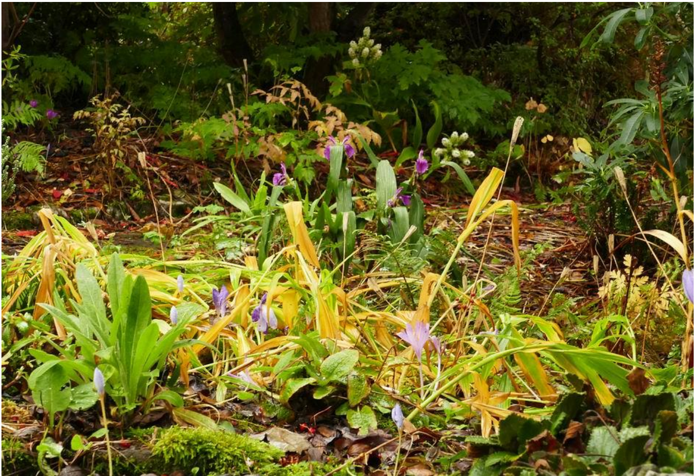
A few plants including Crocus , Colchicum , Roscoea and Veratrum continue to produce flowers.