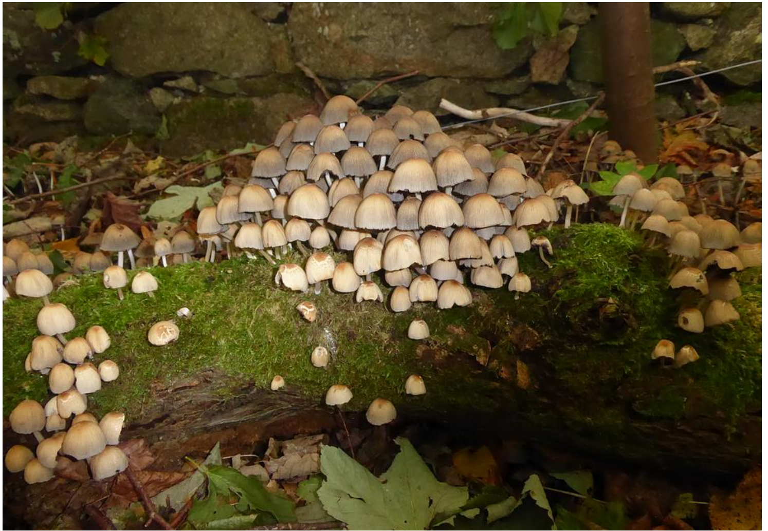
Another outcrop of fungi has sprung out of this old rotten tree trunk which I found lying in deep shade.