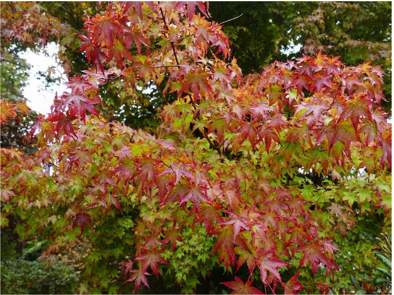
Above the vacciniums the first signs of autumn colours appear on the leaves of a seed raised Acer palmatum .