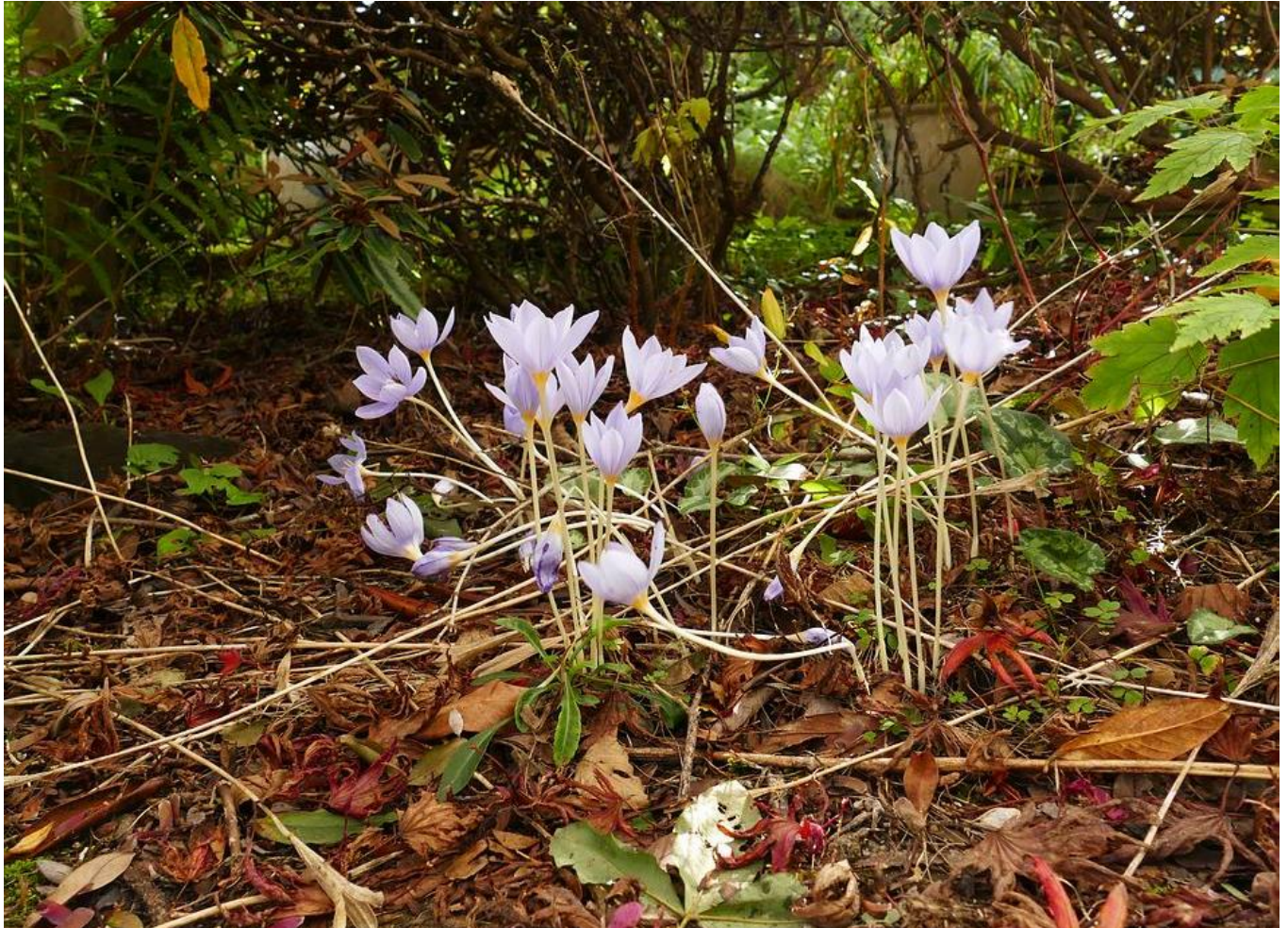
This time Crocus pulchellus grows among the dried remains of Erythronium stems which have shed their seed.