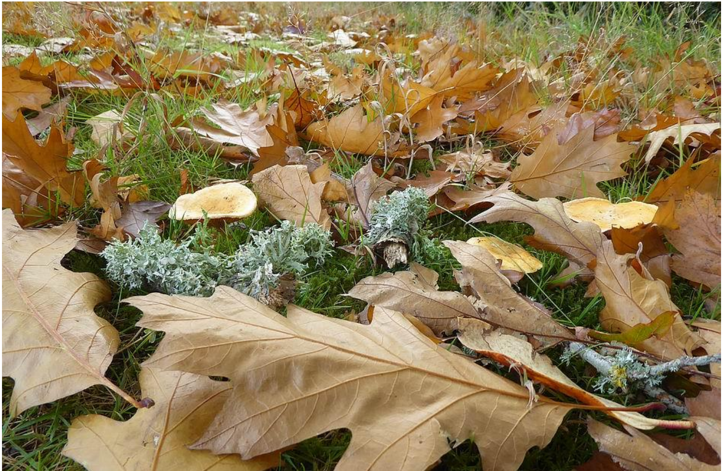
We are entering prime fungus season so as well as those on the trees I find plenty more fungi growing on the ground.